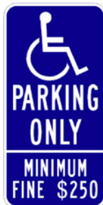
Figure 6 ("R99C")