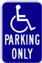
Figure 4 ("R99")