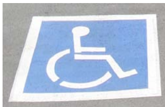
Figure 11 (“ISA”)