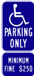
Figure 5 ("R99B")